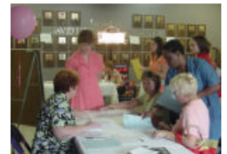
New teachers signing up to join MNEA, TEA and NEA.